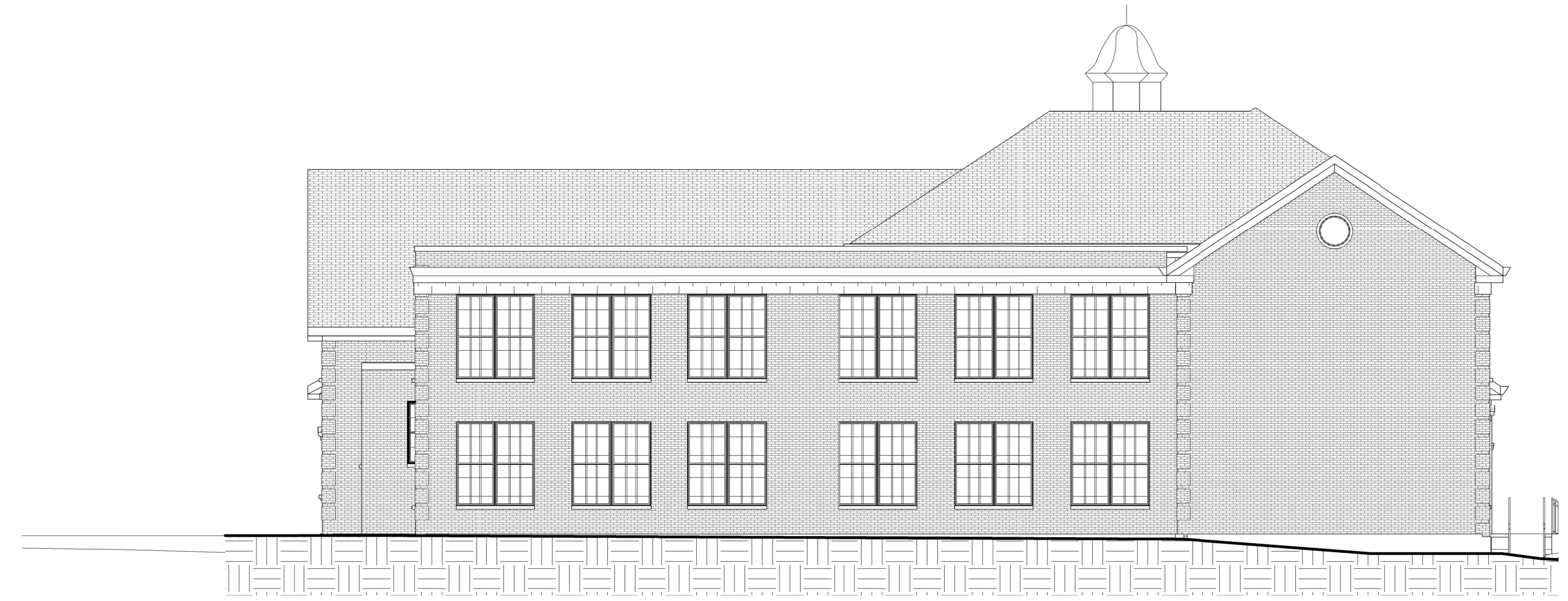
4 West Elevation Exg Building 3/32" = 1'-0"